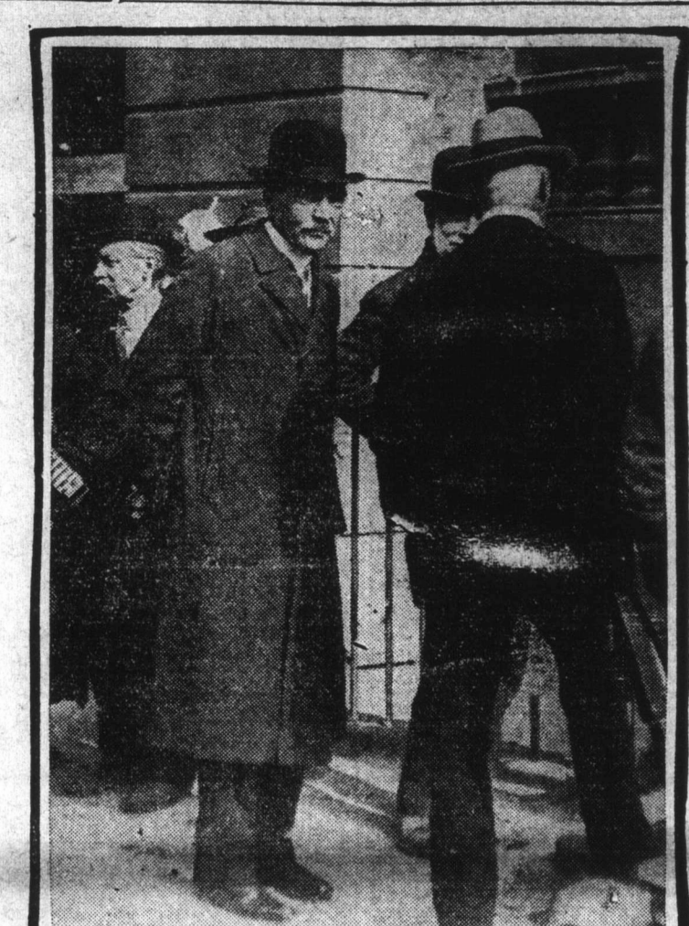
AFTER AN AIR RAID ON LONDON The photograph shows Sir Edward Henry, the Metropolitan police commissioner, the central figure, visiting the damaged area after a recent air raid on London

LETTERS TO THE EDITOR LETTERS TO THE EDITOR LETTERS TO THE EDITOR