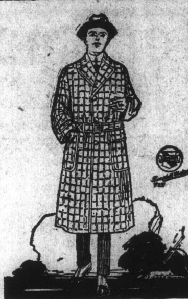
—Forty-four Inches Long —All Wool Tweed Cloth —Grey and Brown Shades —Belted —Shoulder Lined.

LETTERS TO THE EDITOR LETTERS TO THE EDITOR LETTERS TO THE EDITOR