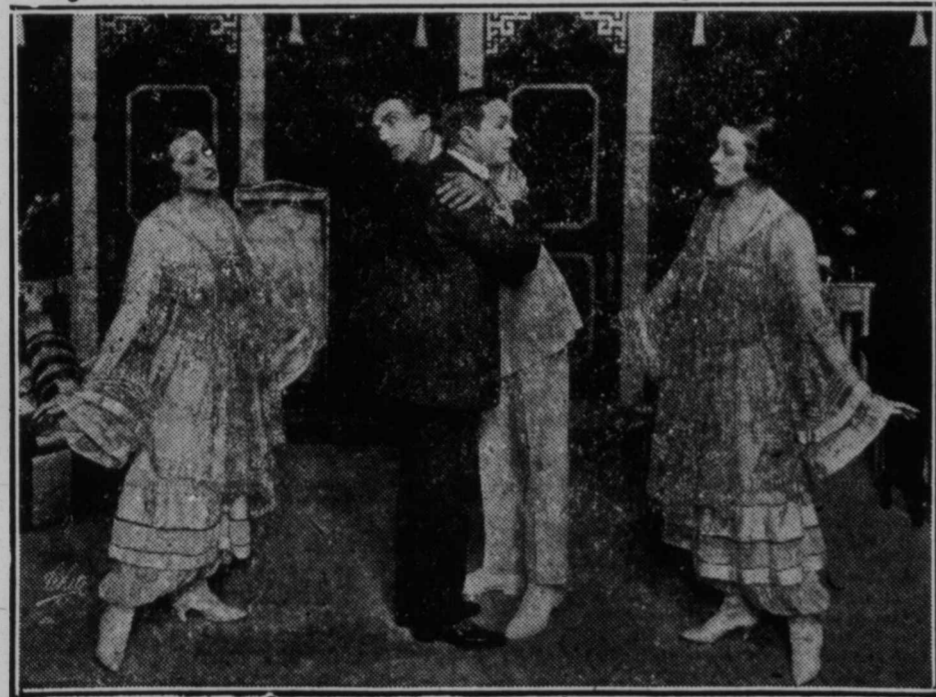
SCENE FROM THE FIRST ACT