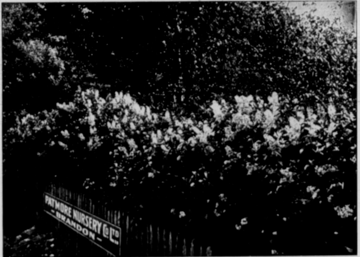
Lilac Hedge in Bloom. Photo taken Brandon, May

We grow and offer all of the Hardiest of Hardy Fruits, Apples, Crab-Apples, Plums, Cherries, Gooseberries, Currants, Raspberries, Strawberries, Rhubarb, etc., the very fruits that are needed for the comfort and health of the Western prairie home. Honey-suckle, Bushes, Asiatic Maples, Russian Shrubs, Elms, Spiraea and other Hardy Shrubs. Hardy Rose Bushes, Peonies and the old-fashioned but ever popular Herbaceous Plants.