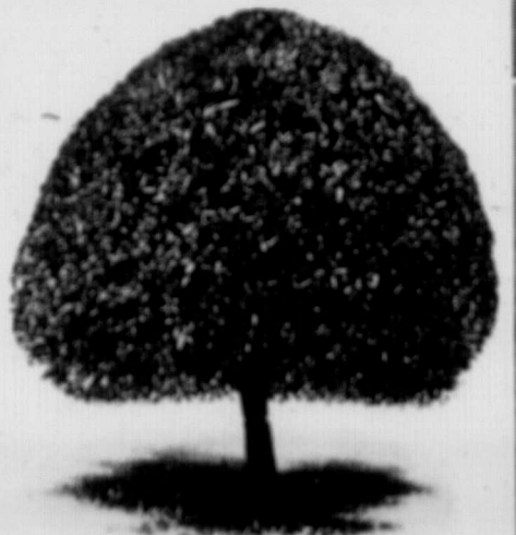
Russian Golden Willow, Trimmied as a Dwarf Compact Tree. These Willows are Capable of being Grown in any Form Desired, either as Shrubs, Dwarf or Tall Trees

Western Agents for Suttons' Seeds in Sealed Packages