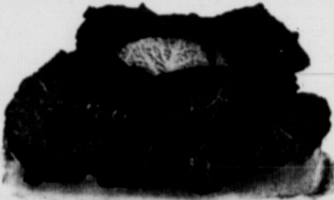
Sutton's Best of All Navy

PATMORE NURSERY CO., LTD., BRANDON, MAN.