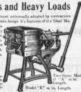
Two Sizes: Model "A" 16 in. Length. Model "E" 24 in. Length.

Ideal Concrete Block Machine has been almost universally adopted by contractors and builders throughout the world. The interchangeable features of the Ideal Machines make it possible to rapidly and economically produce concrete blocks for every building purpose, from the most massive construction to daintily beautiful styles of architecture. The machine makes blocks of any length within capacity, any angle, 4, 6, 8, 10 and 12 inch widths, 4, 6 and 8 inch heights, and any desired design of face.