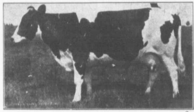
The Desirable Kind of Foundation Stock