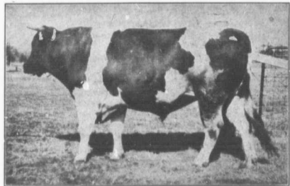
1884 The Herd Sire at "Hamilton Farms".