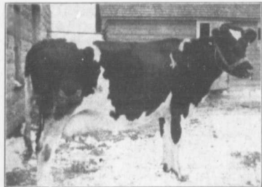
Another Big Producer with Quality Breeding

Among the large number of thrifty young stuff coming on are six year-old