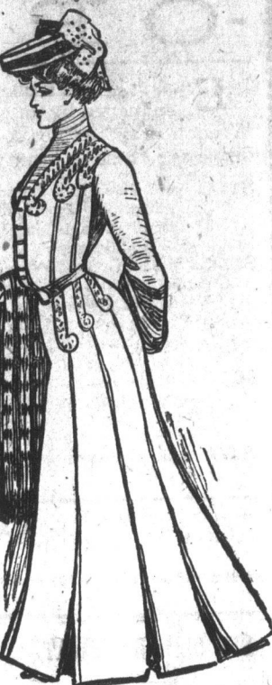
BLUE CHEVOT TAILOR MADE.

A smart three-quarter length sack wrap for outdoor wear was of mixed