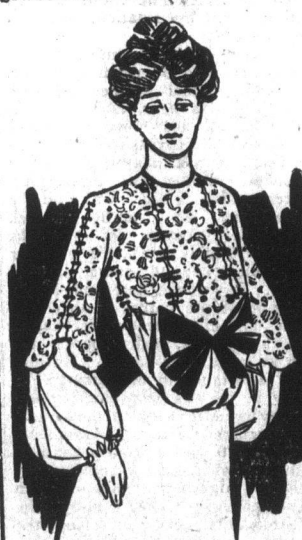
LACE AND CHIFFON BLOUSE.

Irish crochet makes very pretty gowns combined with blue linen. Ecru