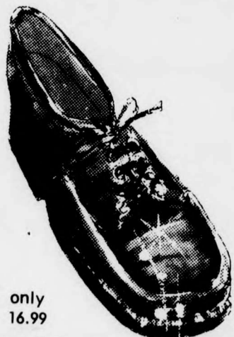
Brown Antique Black Glove