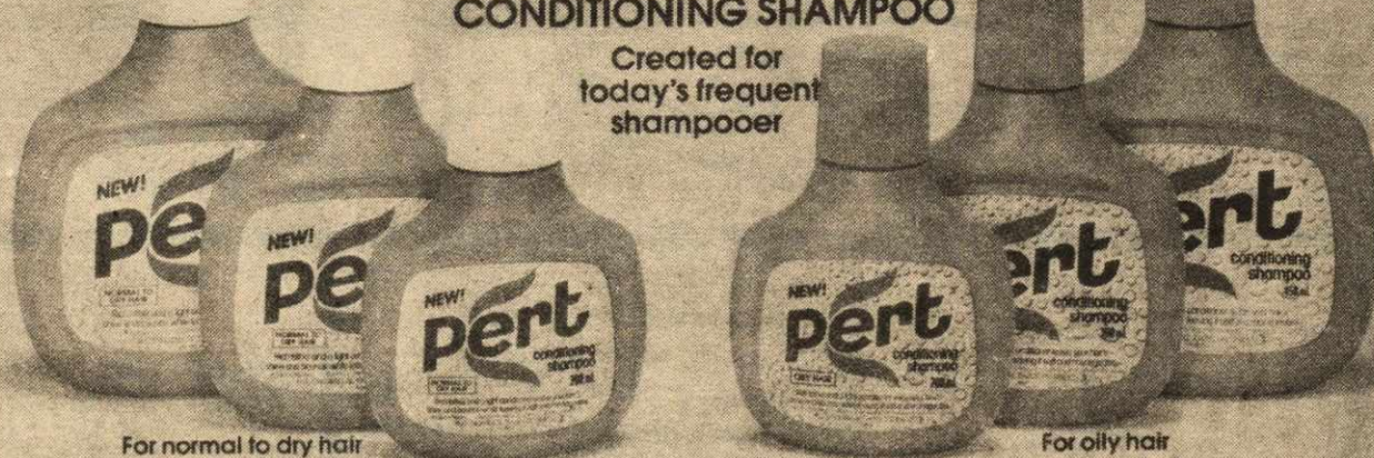
For normal to dry hair