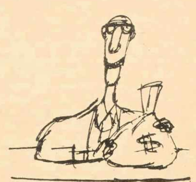
I SPEND THEM AS FAST AS I CAN!

serve a similar function by supporting the government through taxes and royalty payments.