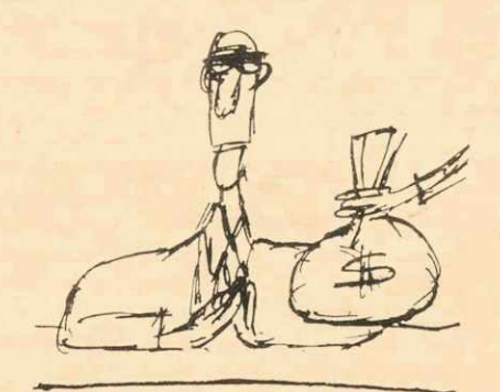
IN FACT I FIND THESE PROFITS SODISTASTEFUL THAT...