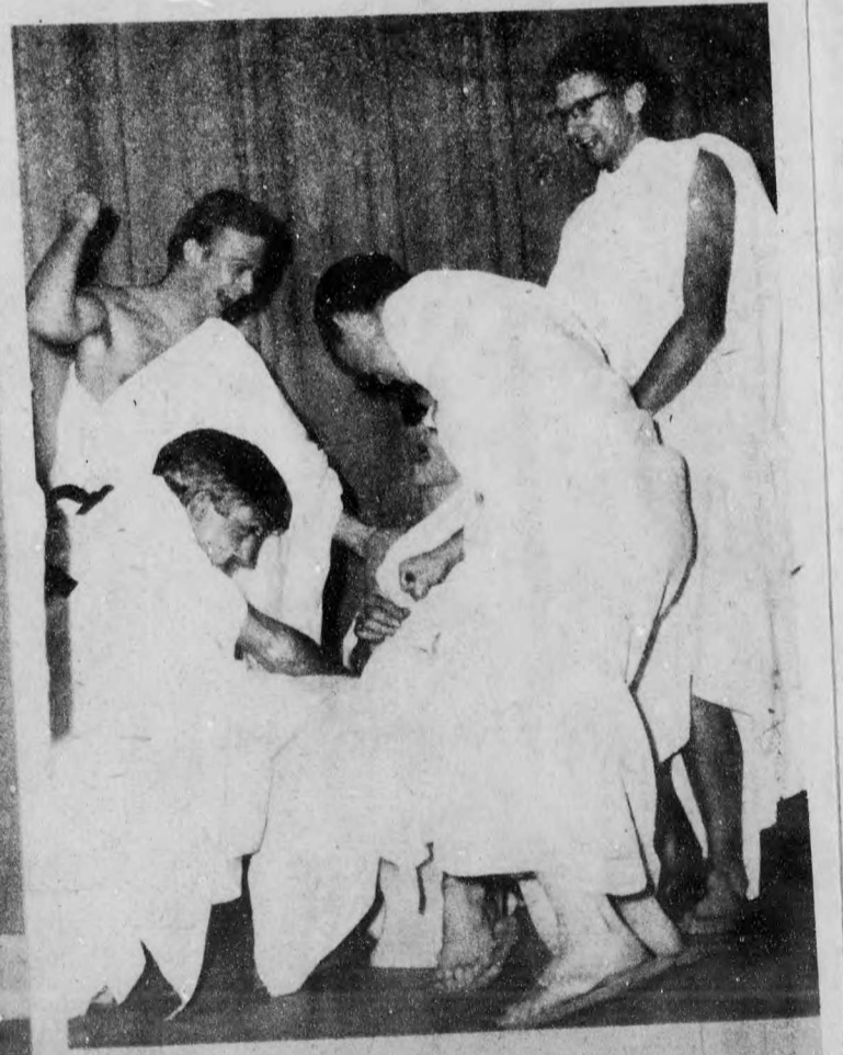
Beware The Ides of Reading Week