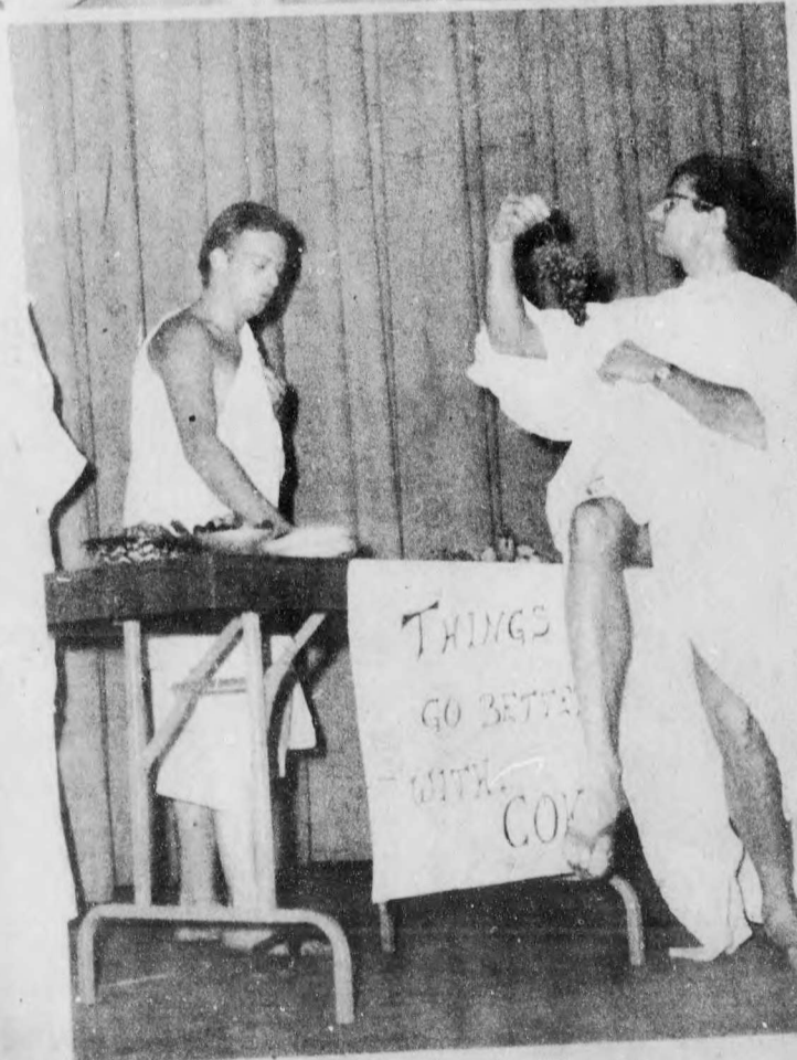
THINGS GO BETTER WITH COKE