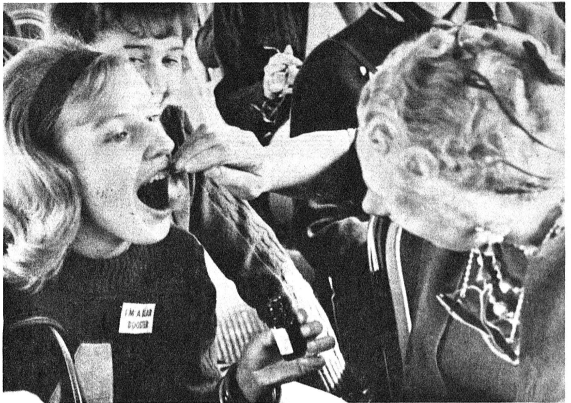
COME ANY CLOSER, I'LL BITE YOUR FINGER OFF—How many cheers could a cheer leader lead, if a cheer leader could lead cheers? How many swabs can a throat swabber swab if a cheer leader does cheer lead?

Continued on Page 3 (See Profs Arrested)