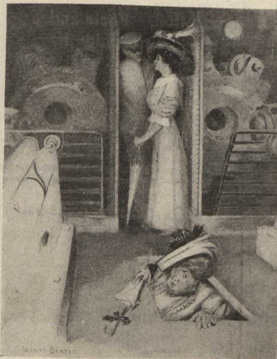
Chaperoning on a Battleship.— Life .