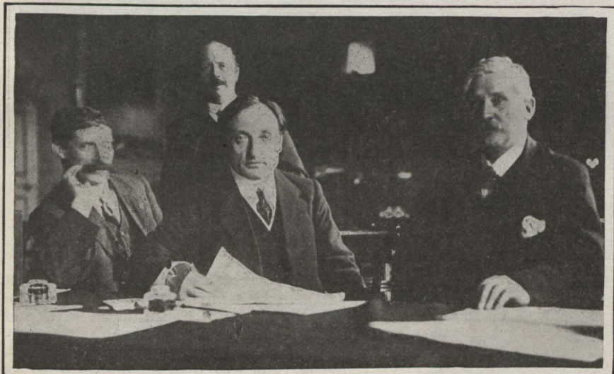
Mr. Ben Tillett and Mr. Harry Gosling, Labour Leaders, at the Government Inquiry into the Transport Strike.