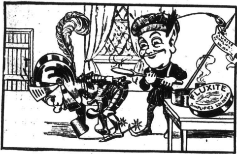
The needy knight, Battered and bent, Uses Fluxite To mend the rent.

The price of this remedy is 25 and 50 cents per bottle. It is put up in a yellow wrapper; 3 pine trees the trade mark, and is manufactured only by The T. Milburn Co., Limited, Toronto, Ont.