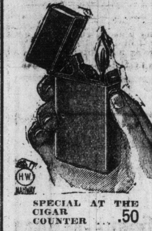
SPECIAL AT THE COUNTER .50