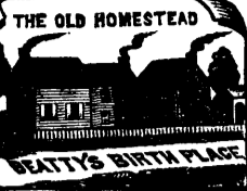
Near Beattystown, New Jersey.