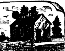
At Mount Lebanon, New Jersey.