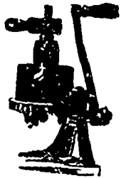
Crank or Balance Wheel.

The Cyphers hatches out a larger percentage of good, strong, healthy chicks than any other incubator on the market. Take the Cyphers machines and don't do as many of our customers have done, bought two or three other makes of incubators and then had to buy the Cyphers from us to hatch chickens with. The Cyphers is a strictly first-class machine in every respect and will last a life time. No moisture required as the machine supplies its own moisture.