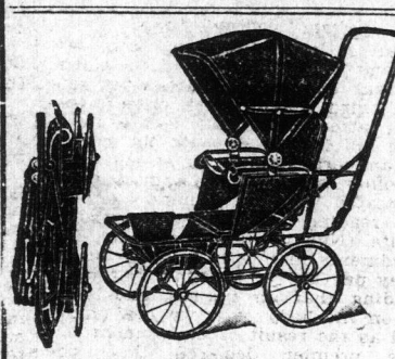
JUST A SAMPLE VALUE

helps for this house cleaning business-step-ladders, curtainstretchers, all sorts of scrubs, etc. This is the shop that can make this labor lighter. Just try us.