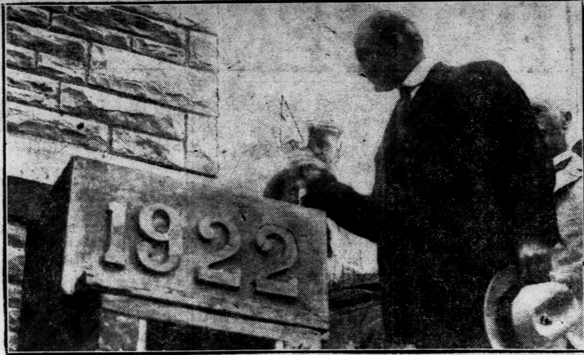
LAYING WESTERN UNIVERSITY CORNER-STONE.

Thousands of tons of rocks and ashes were hurled to a height of from thirty to sixty feet from both the old and new craters, and the lava streams advancing on a frontage estimated at 500 yards laid waste the