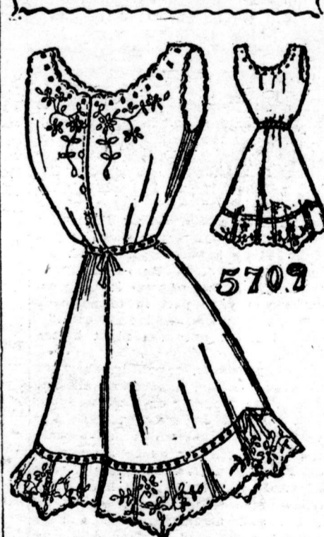
A Dainty Combination Garment. 5709—Paper Pattern, sizes 32 to 42. Price 10 cents.

700—Perforated Pattern for Embroidery. Price 25 cents. This Combination Garment is of most excellent shaping and quite simple in construction. The drawers are wide and full, while a circular flounce affords a pretty finish for the lower edge. Darts remove all fullness over the hips, gathers disposing of that in the back. The Corset Cover is fitted by shoulder and under-arm seams. The lower edge is finished by a hand of ribbon-run sewing to which the drawers are attached. Size 36 will require 3 3/4 yards of 36-inch material. Embroidery Pattern 700 applied to this design is very simple and pretty and should be worked in eyelet embroidery. Paper pattern, or perforated pattern of embroidery mailed to any address on receipt in silver or stamps, of price given above.