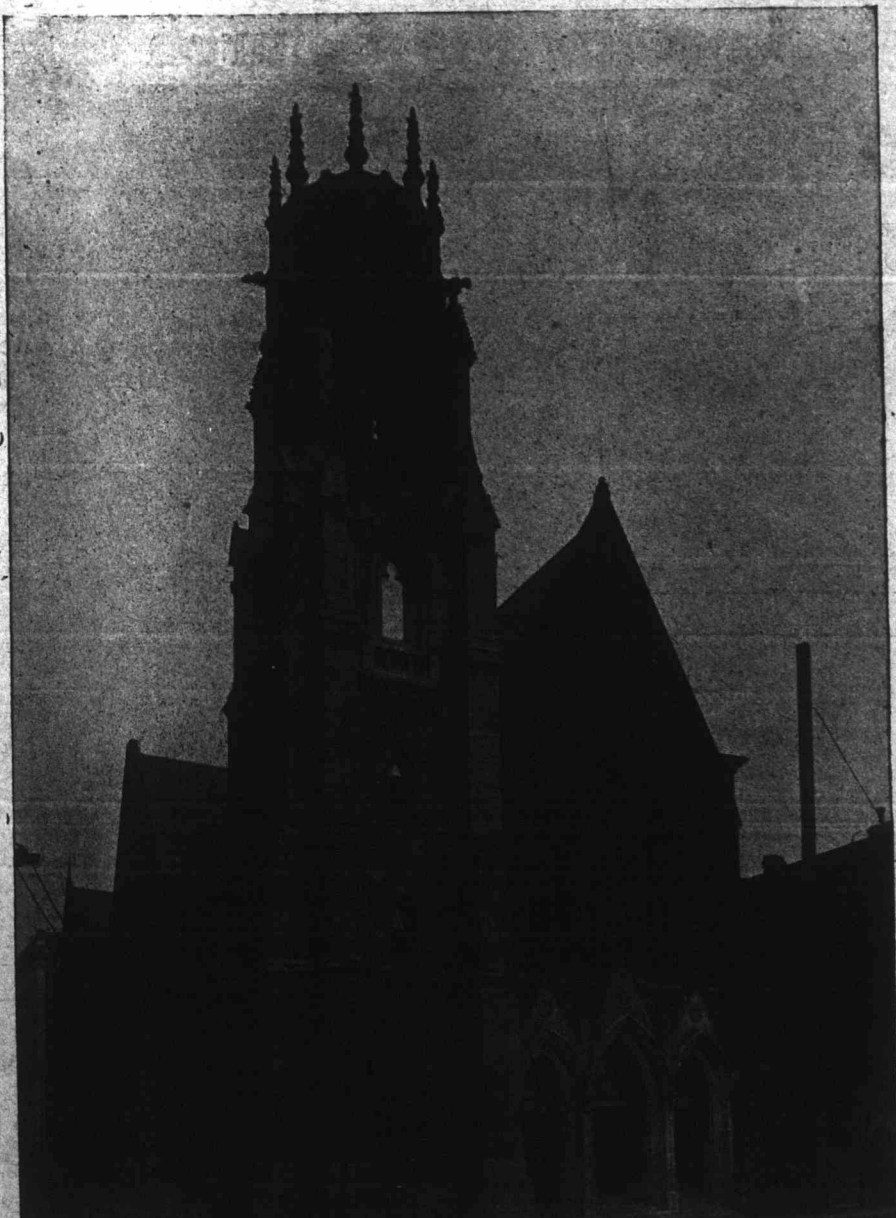
CHRIST CHURCH CATHEDRAL, ST. LOUIS, Mo., U.S.A.

All of the officials of the presiding Bishop and council, the new governing