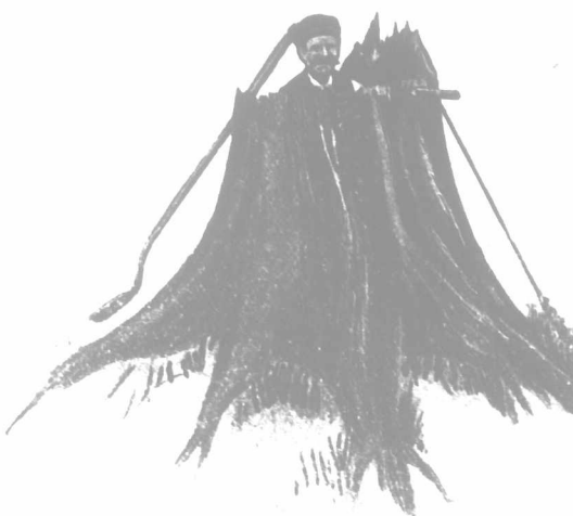
See what happened to this stump by using Stumping Powder.