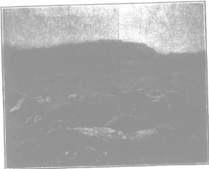
This cut shows how boulders are removed by using our new explosive.