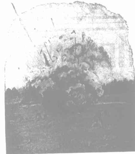
This is what happened to the stump by using Stumping Powder.