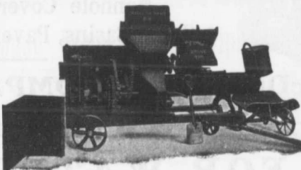
Furnished with Steam, Gasoline or Electric Power.

This hoist is designed for use with our vertical engines and is intended for general contractor's use where a double platform elevator is employed, one platform descending as the other ascends. It is equipped with winch head on one side which can be used for elevating beams or other material that cannot be taken up on regular elevator. The drum sheave over which the elevator cable runs is placed on the other side of hoist. This sheave and the winch head are interchangeable so that they can be placed on either side desired. Can be operated by steam, gasoline or electric power.