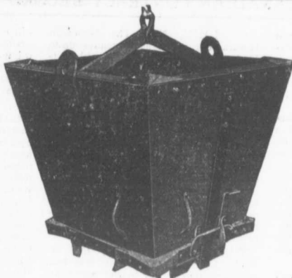
Sole Canadian Agents

Is built especially for hand- ling Concrete under all conditions. Furnished in all sizes with hand or rope tripping device, and fitted with chain or iron ball as required.