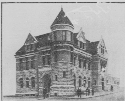
POST OFFICE, NELSON.

city. It was incorporated only in 1897, but ever since has made regular and substantial progress. Including the suburbs it has a population of some 6,000 people, but the city has most of the facilities and conveniences of one of many years longer standing. Possessing its own electric light and water systems, an electric street car service and public buildings that supply the wants of a small metropolis, Nelson is an up-to-date town. Situated at an altitude of 1,760 feet above the sea level and on the southern shore of a beautiful stretch of water, Nelson presents many advantages as a residential city, while in addition to its natural attractions it has those of excellent schools, good churches, a large and well appointed hospital, and many well supported social, athletic and educational clubs and societies.