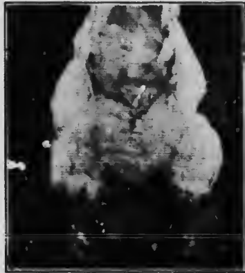
Showing good straight legs set well apart, as well as good spread and depth at rear of body.

It is also shown by the spread across the rear of body and depth from tail to underline of the body, as shown in cut 19.