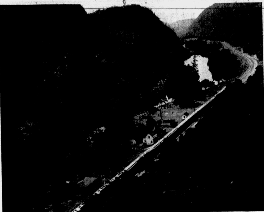
Winding its way through the remote, undeveloped regions of northern Ontario near Sault Ste. Marie, the Algoma Central Railway's excursion train to Agawa Canyon (above) cruises beside rivers, lakes, forest and