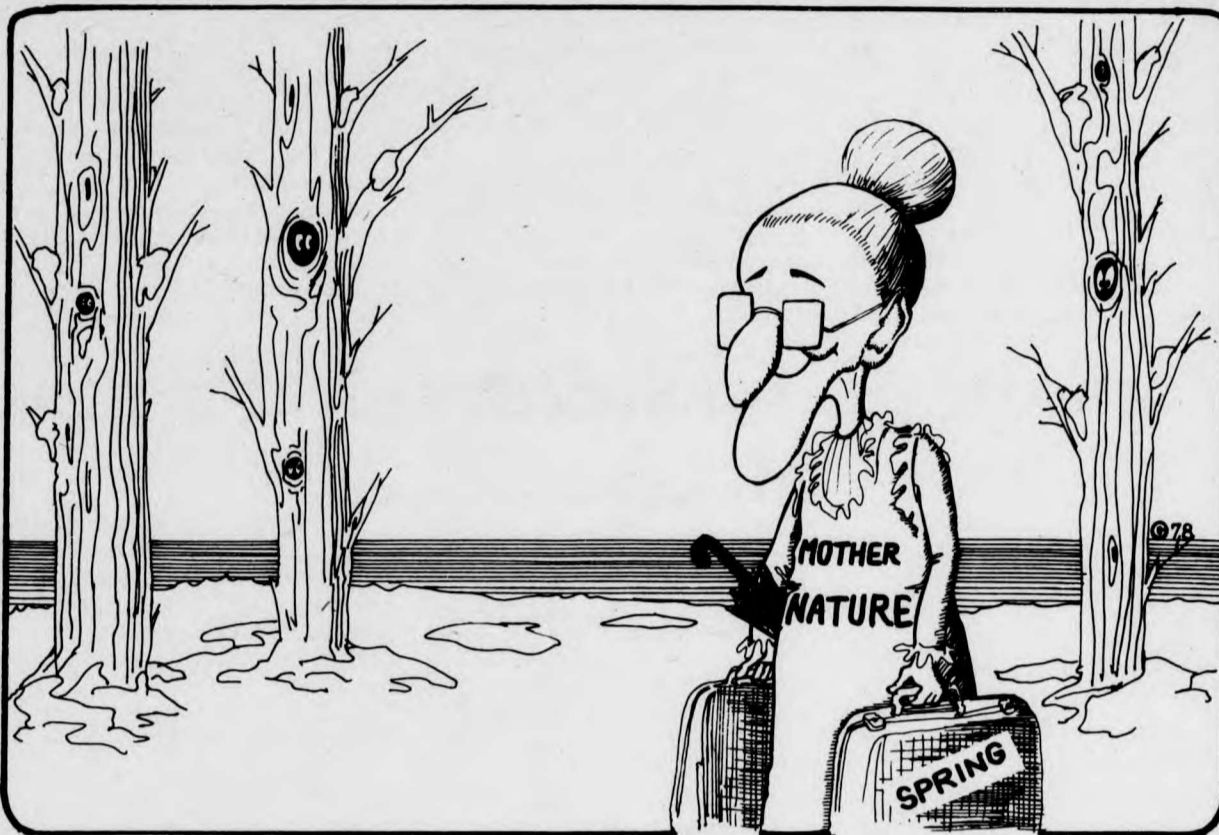
apologies to Buck Brown