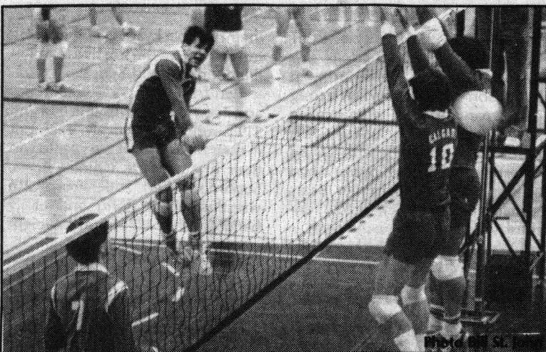
Dinosaurs capture North-Am title.

Dinosaurs, however, were able to rally and they defeated their opponents 15-9.