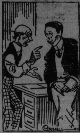
"Bet You Two Bits," Said Dudley.

The clock proved him a whole hour late when "Get-Away-Quick" Ballingame arrived at Carr, Lodi, Lott & Co's office. The day before Ballingame had been warned by Mr. Carr that he shouldn't be late again with- out a good excuse.