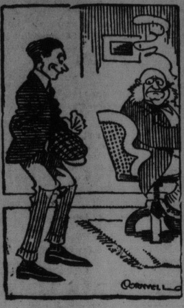
"Somebody Hid My Lid."

The fight was a well-fought one, with both men showing their best. The result was a victory for Willard, who had been a long-time contender for the title.