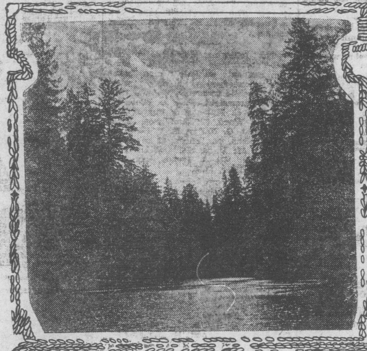
THE WEST COAST—AN IDEAL REACH ON THE SARITA RIVER.

From all indications the number of tourists who will visit this portion of the island during the approaching summer will be far greater than in previous years. The Nanaimo-Alberni