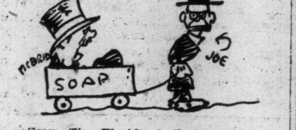
(From The World's bulletin screen.)