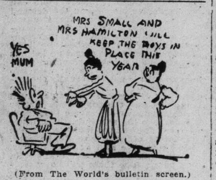
(From The World's bulletin screen.)