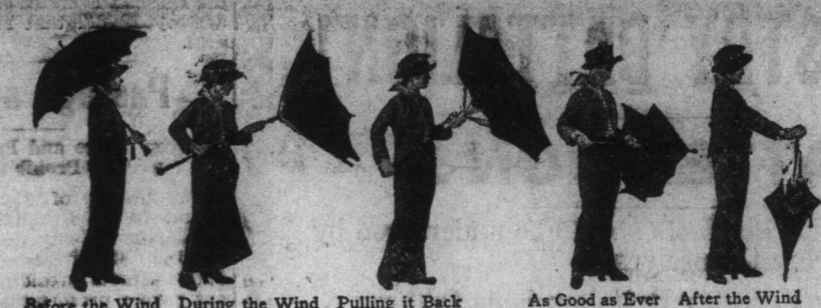
Before the Wind During the Wind Pulling it Back As Good as Ever After the Wind

TRAPS DAMAGED—Some cod traps used for holding good berths, were damaged by ice on the local fishing grounds within the past few days.