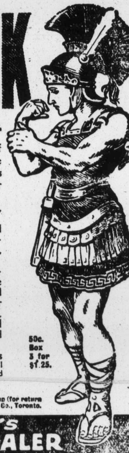
50c. Box 3 for $1.25.