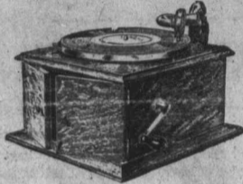
VICTROLA VI—with 12 Selections $46.90

We take pleasure in announcing that we are in receipt of word from headquarters, that the shortage of Victor-Victrolas, caused by the excessive demand during the Xmas Season, is being overcome, and that our large order of instruments, given over two months ago, has been shipped. Victor-Victrolas are made in Fifteen different models, of which the following four are the most popular.