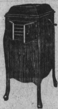
VICTROLA X—with 12 Selections $122.90