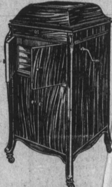
VICTROLA XVI—with 12 Selections $290.40

We sell these instruments at the above cash prices, or on payments TO SUIT YOU