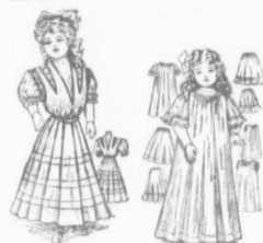
5806 Doll's Jumper 5794 Doll's Underwear Costume, 18, 22 and 26 18, 22 and 26 Inches long. Inches high.

The costume consists of skirt, jumper and gimpie. The jumper is made with front and back and is closed invisibly at the back. Its lower edges being joined to a belt. The skirt is made in one straight piece laid in over lapping plaits, and the gimpie with plain front and backs and full sleeves.