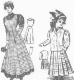
5815 Work Apron Sleeve and Cap, Small, Medium, Large.

The apron is made with front and side portions that are extended to