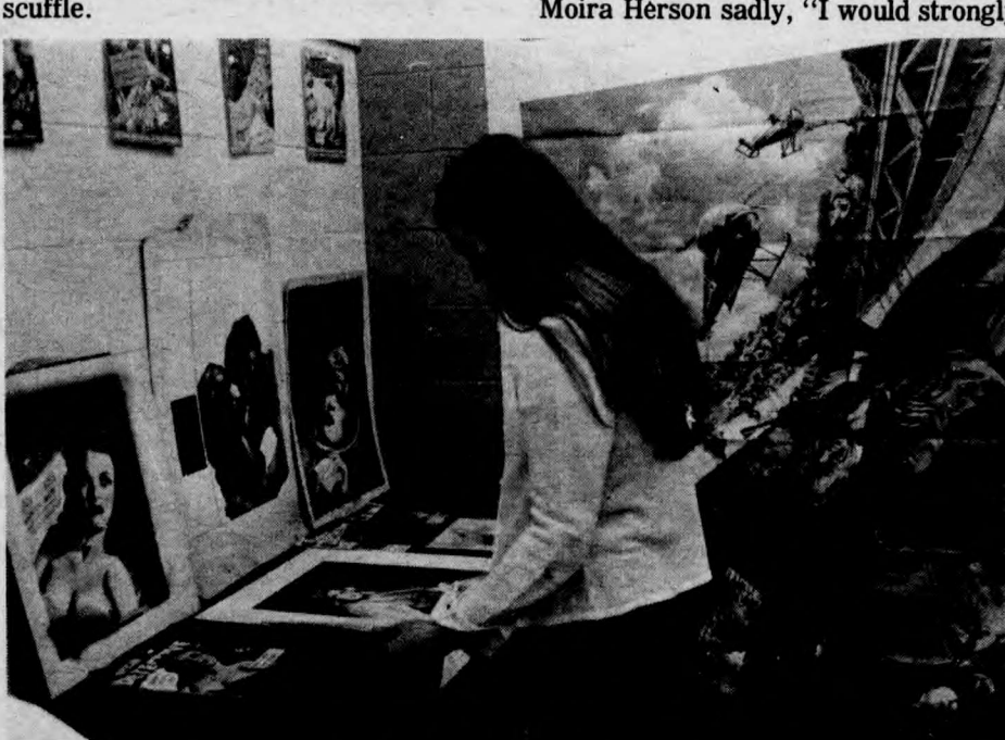
A Cosmicon browser inspects one of the Memory Lane display rooms

The panel ended and everyone in the audience dove to the stage to get Kurtzman's autograph. Urry escaped in the