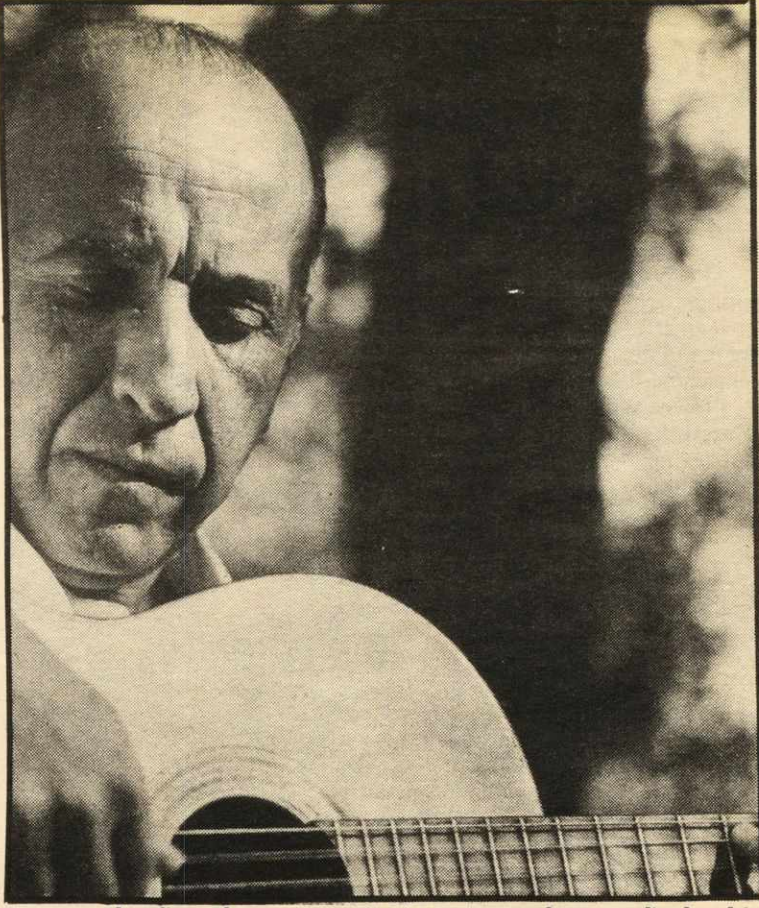
The first Flamenco guitarist ever to dare to display his artistry in a solo concert, he has been hailed by aficionados everywhere as one of the truly great masters of our time. At 81 years of age, Montoya is still going strong. The legendary Spanish master of flamenco guitar will perform at Rebecca Cohn Auditorium, Friday, March 30 at 8:00 p.m.