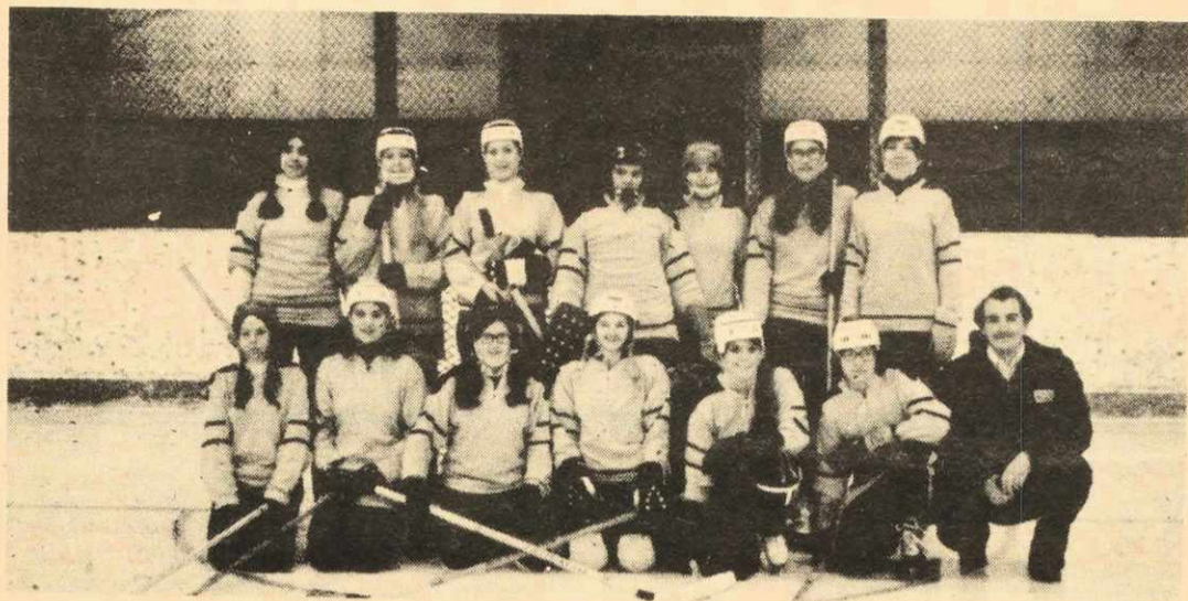
Dal Women's hockey team... consolation winners