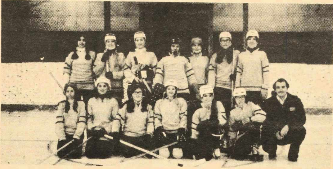
Dal Women's hockey team... consolation winners