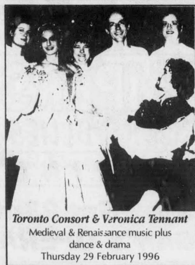
Toronto Consort & Veronica Tennant Medieval & Renaissance music plus dance & drama Thursday 29 February 1996