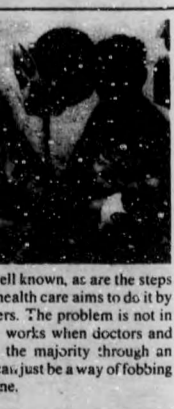
ell known, as are the steps health care aims to do it by ers. The problem is not in works when doctors and the majority through an aw, just be a way of fobbing ne.

change possi- these places ke Canada ch countries the cards in development: holds the nic change. ve a majori- world bank, distributes s of interna- rich coun- regulations discourage tries from own raw ally to our the third it is both a eap raw uge market red goods, ical exper-