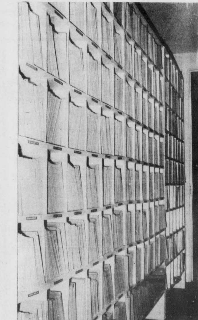
A Record Library consisting of over 23,000 records