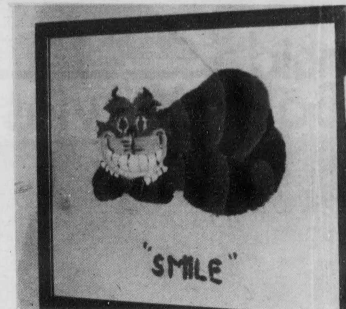
CHSR's mascot cat.