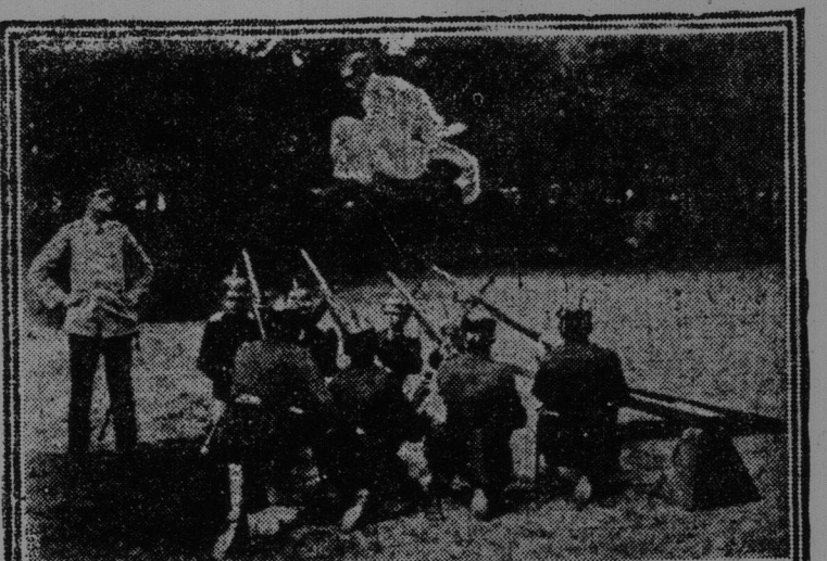
aining of the German recruits. It shows one of the ways in which the nerve of the men is tested-by jumping over a barrier of bayonets.

They Had Some Difficulty in GERMAN RECRUITS ARE TAUGHT TO JUMP OVER A BARRIER OF BAYONETS.