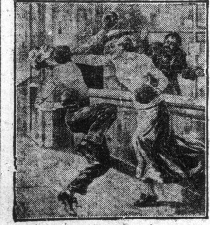
Scene from "A Midnight Escape" Majestic.

The sensational melodrama. "A Mid-might Escape," will be the offering at pimples along. " ( ) wouldn't like to have to take the being, why you suffer. The fact is the Majestic next week. It is a drama, offered locally. With opening scenes on the Bowery. New York's most picturesque thorofare, the action goes to the East Side of the city and back to week. These wonderful little workers have meal you may be able to sit down and cured bad boils in three days, and some look at your meal straight in the face of the worst cases of skin disease in a with a keen appetite and a smile, and enjoy thoroughly everything you the East Side of the city and back to