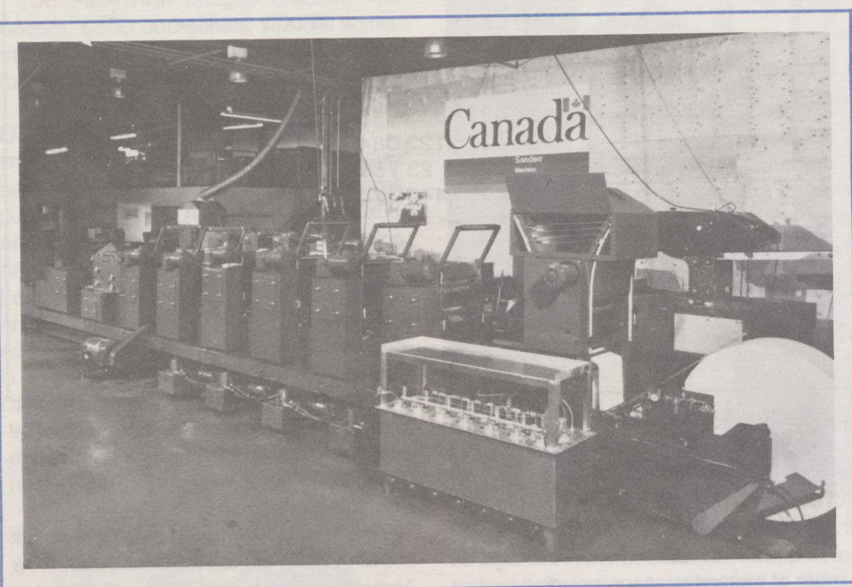
This variable size press from Sanden Machine Limited of Cambridge, Ontario requires only a pull on a lever to make it the fastest available today for size changeover.

Canadian manufacturers are among those in the forefront of developments in the printing field. Several of their new products are being shown for the first time at Canada's exhibit at DRUPA 86 in Düsseldorf, Federal Republic of Germany, May 2 to 15, 1986.