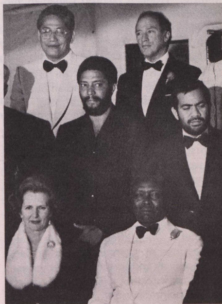
Prime Minister Pierre Trudeau (top right) stands with other Commonwealth Heads of Government following a dinner with Queen Elizabeth aboard the Britannia.

While in Melbourne Prime Minister Trudeau took the opportunity to meet