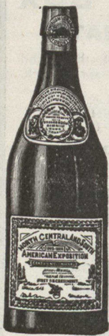
FAC-SIMILE OF WHITE LABEL ALE