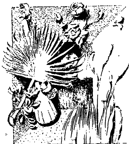
THE MODERN DECORATIVE PICTURE-FRAME.

Just send your name and address, and 10c. for postage, and receive by Mail a HANDSOME SILK HANDKERCHIEF and The Magic Needle! Antislavery everyone! Address, Whitson Novelty Co., Toronto, Ont.