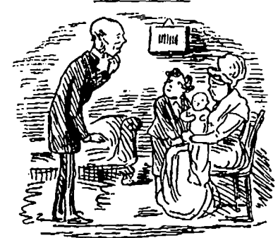
A STRONG RESEMBLANCE

was lost in a jumble of words in which only "take somethin" was recognizable. Grif thought awhile and came to the conclusion that he knew almost everything worth knowing.